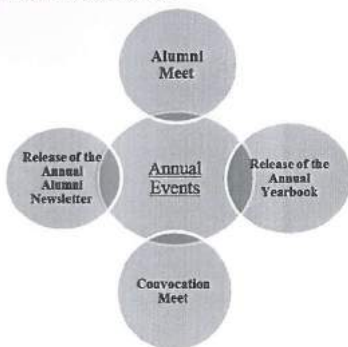
Figure 3-Events Organized by Alumni Committee

The programmes and events organized by the committee as shown in Figure 3 can be divided into two broad heads, Annual events that are held once a year and on-going programmes that are continuously running all through the year.