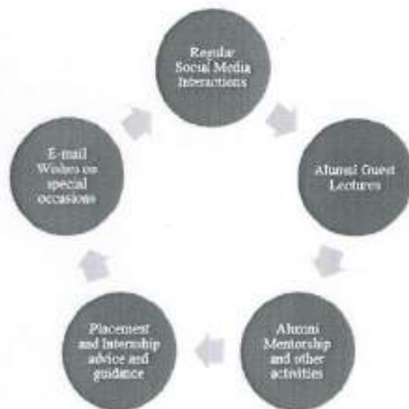
Figure 5-On-going activities and Programmes

The committee undertakes number of activities year throughout the year. The primary objective of these activities to stay connected with the alumni base. Alumni also help in several activities at the institute levels such as summer internship, final placements, advising or mentoring students, working as visiting faculty for teaching courses or delivering lectures in very specific domains. Figure 5 below shows yearlong activities undertaken by the committees.