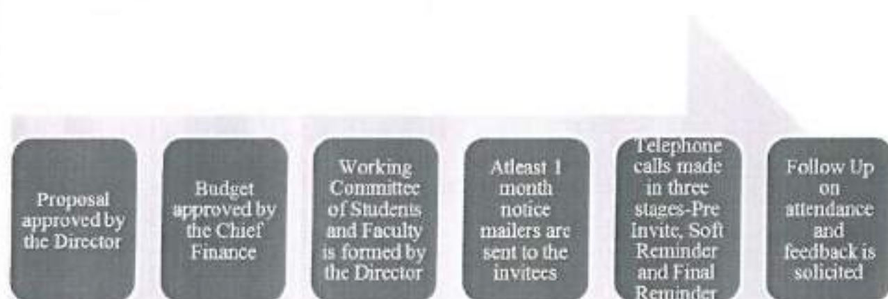
Figure 4-Standard Operating Procedure for all Events

Since alumni committee conducts several events every year in the campus and outside the campus, it is imperative to have set of guidelines to ensure highest quality is maintained for the conduct of the event and proper accountability is in place. This is also considered as a learning experience for students which prove to be useful once they join the corporate world. As shown in the Figure 4, there are various steps involved to be executed by the committee members working with the Head of the institution and faculty in-charge and the Finance department.